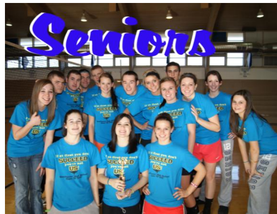
Third place team.