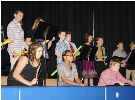
The upper elementary.