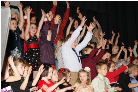
The lower elementary.