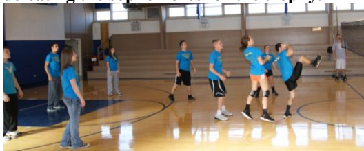
The seniors battle the eighth grade for third.