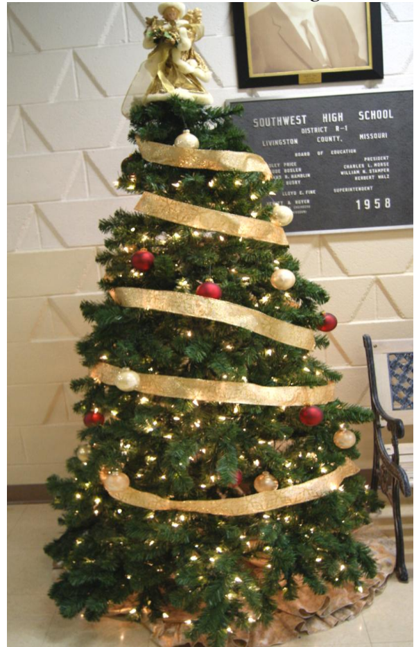
The Christmas tree by the Principle's office.

So it's not how awesome the present is, it all depends on the person who gave it to you and what it means to you. That's what the true spirit of Christmas is. It's a time for sharing and caring.