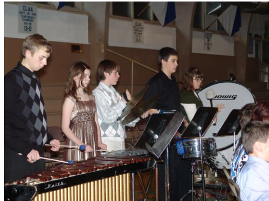
Elementary and secondary combined concert band during December 13 Winter concert.