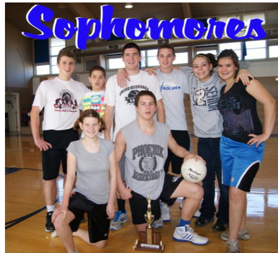
Second place team.