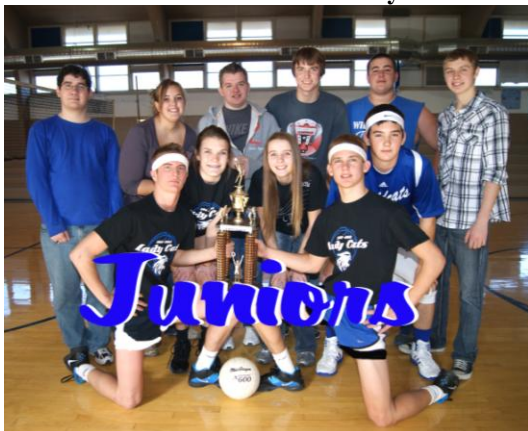
The juniors were the winners of the Christmas volleyball tournament after defeating the sophomores for the trophy.