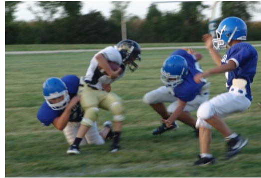
The Wildcat defense gangs up on the Norborne ball carrier during the first quarter on September 13 at home.

The junior Wildcat football team opened their season with back to back games on Monday and Tuesday of Homecoming week, which was also the CLAA softball tournament. It was certainly an action packed week, and the Junior Cats helped add to the excitement.